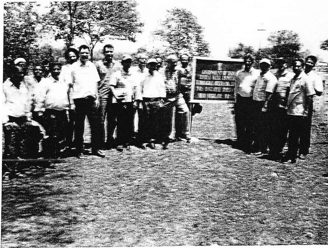
Visit to Joint Observation Site at Feeder Canal, Farakka