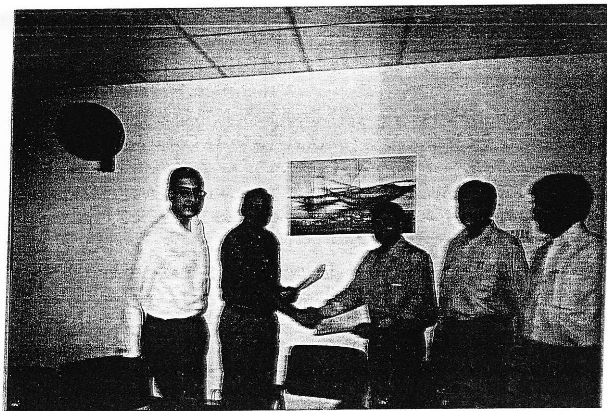
Exchanging the Records of discussions of 39 th Meeting of Joint Committee by Members, JRC