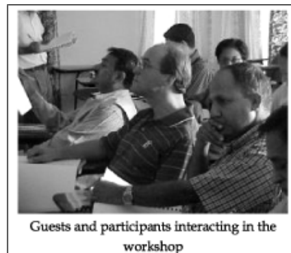
Guests and participants interacting in the workshop

The Guide was developed and was field-tested in Khimti Hydropower Project. The Guide was discussed with the representatives from various sectors (Annex 4). The workshop was organised on 10 October 2004 at SchEMS Hall, Shantinagar, New Baneshwor.