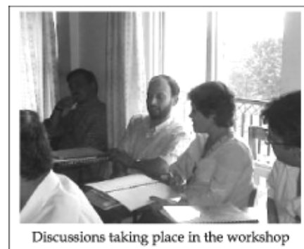
Discussions taking place in the workshop